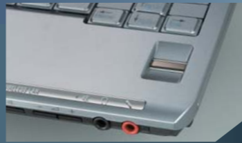
Frontal headphone jack Convenient Mute button and Volume buttons Convenient fingerprint recognition