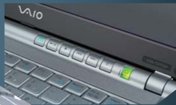
Unique AV buttons